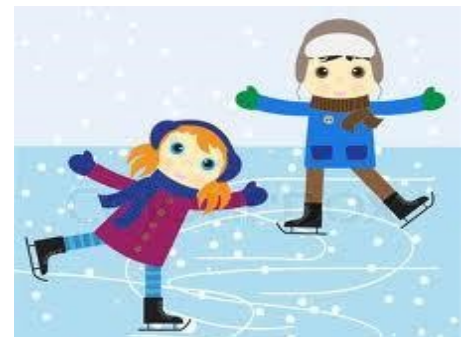
Elementary Skate Day - Jan 28